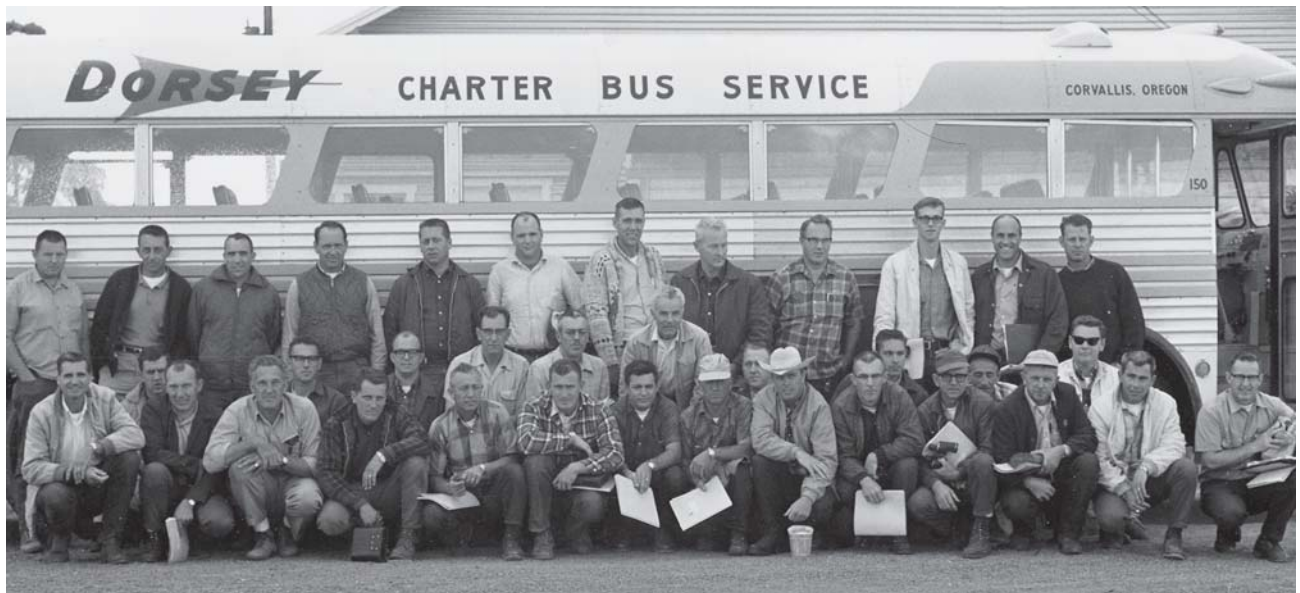
How many can you recognize from this bus trip in 1968?