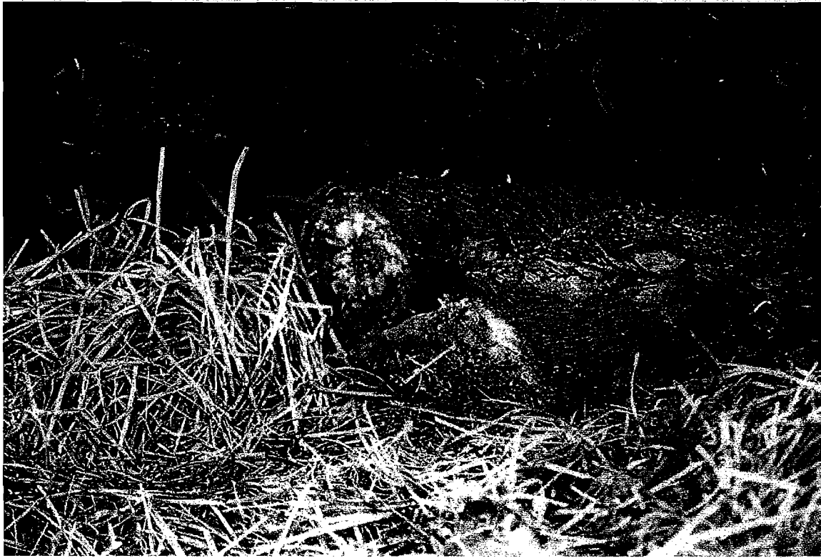
Figure 1. A cow that has sloughed her rear hooves after consuming endophyte infected tall fescue straw during a period of cold weather in Eastern Oregon.