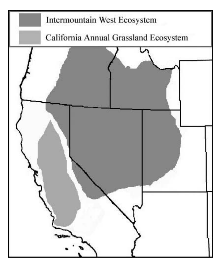
Figure 1. Map of the Intermountain West and California Annual Grassland regions in the western United States.

Because medusahead occurs across such a broad array of ecosystems, development of uniform guidelines to prevent invasion from occurring and manage and restore rangelands where it already exists have been difficult (Davies and Johnson 2011; Young 1992). There are many management options for the control of medusahead but there are no thorough summaries of the current management options across the range of the problem.